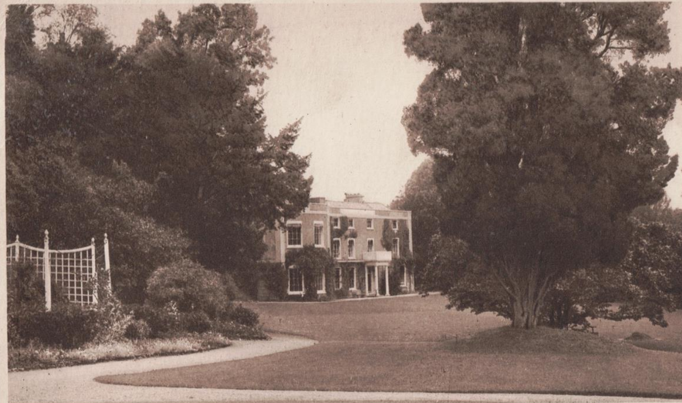
THE RAILWAY CONVALESCENT HOME, "BRIDGE HOUSE," DAWLISH, DEVON HOUSE & GROUNDS