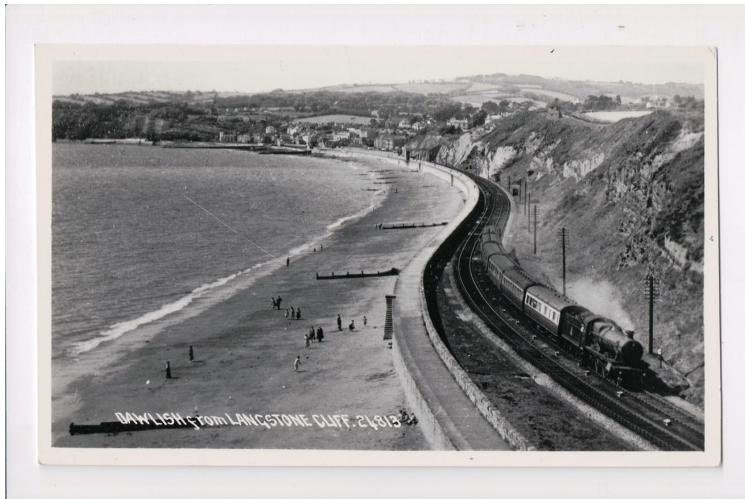
DAWLISH from LANGSTONE CLIFF. 24813

At the far end of the Sea Wall from the top of Langstone Cliff there is a good view back to Dawlish.