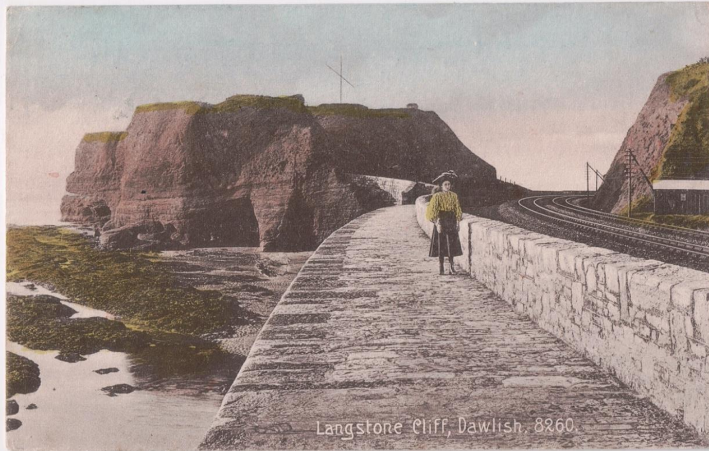
Langstone Cliff, Dawlish. 8260

On our way along to the Warren we can look back at Langstone Cliff.