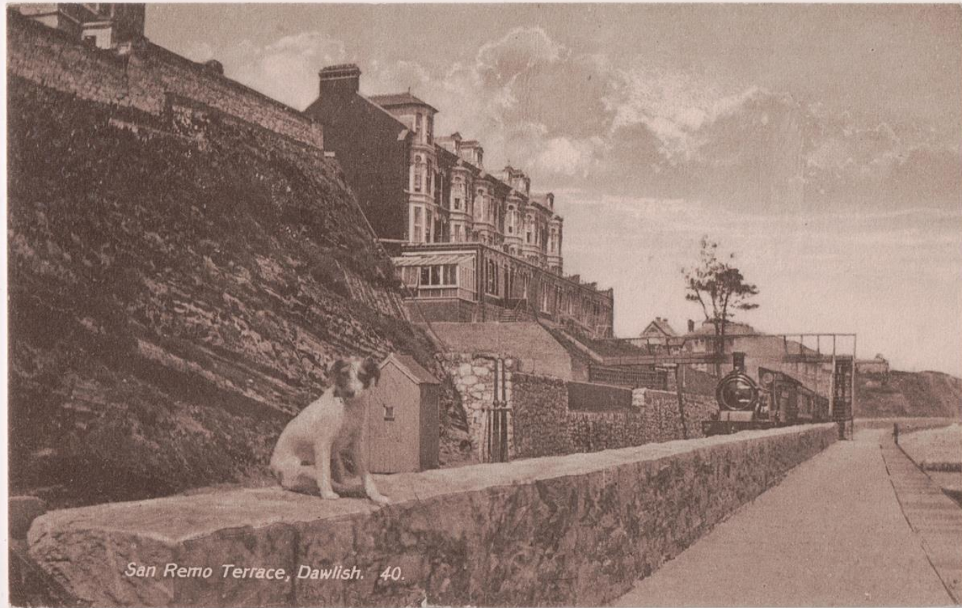
San Remo Terrace, Dawlish. 40.

Once on the Sea Wall there is a chance to relax!